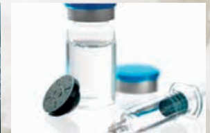
Caps made from Bromobutyl and Chlorobutyl protect medical products from external contamination.