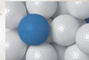
The high elasticity of Buna® CB helps golf balls travel further; its high reversion resistance keeps the balls in shape.