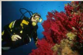
Baypren® makes products such as wetsuits resistant to saltwater and UV radiation.