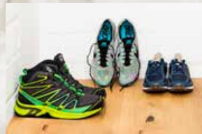
Levapren®, Krynac® and Buna® ensure good grip and low wear and tear in sports shoe soles.