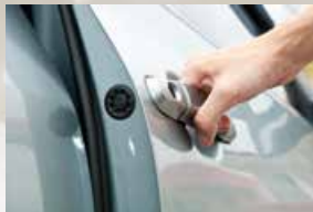
Keltan® Eco, the first EPDM rubber with up to 70% bio-based content, is used to manufacture products such as high-quality seals.