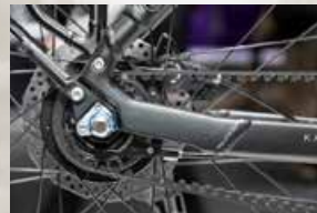
Low-maintenance and durable: drive belts made from Therban® keep e-bikes moving.