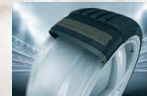
Optimized rolling resistance, excellent grip and long service life: Buna® and Butyl® ensure top performance from car tires.