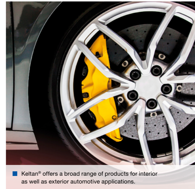
■ Keltan® offers a broad range of products for interior as well as exterior automotive applications.

To make sure you get the most out of our products every Keltan® EP(D)M grade comes with the very best technical support and service. We believe in the synergy of all our technical experts around the world. This global brainpower is at your service through our local service teams. With ARLANXEO as your partner in Performance Elastomers you can be certain of fast, reliable and in-depth support, commercially and technically.